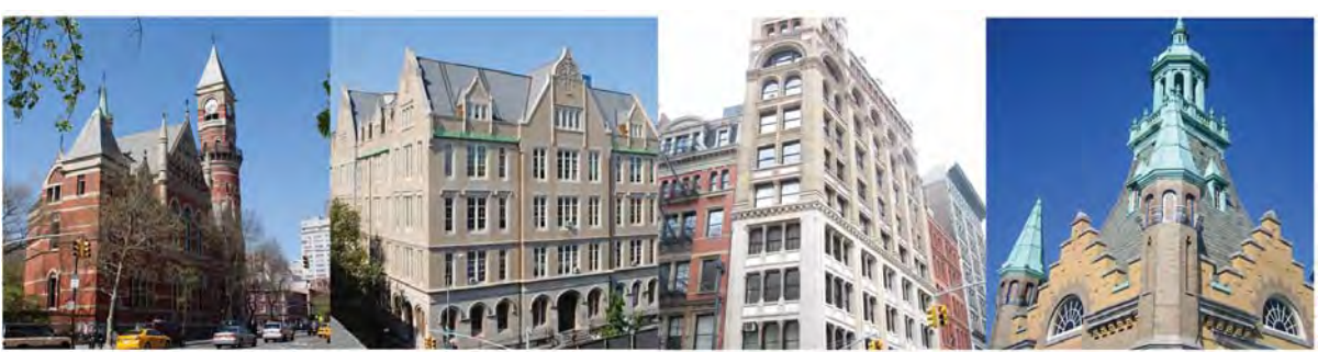
Jefferson Market Library

The original four-story structure is in the Romanesque Revival style. The exterior facades are built of granite-faced masonry embellished with carved ornament, dormers and turrets and capped with a slate mansard roof. The eight-story 1933 addition was made to emulate the appearance of the 1892 structure but is clad in terra cotta above the first floor.